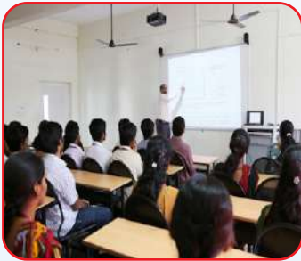
Digital & Comfortable Classroom