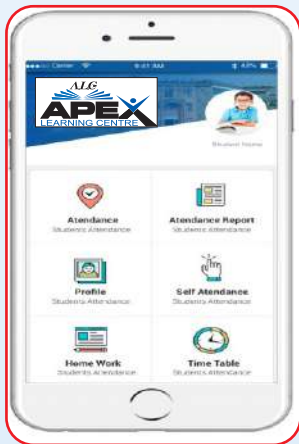
Smart Class Mobile App