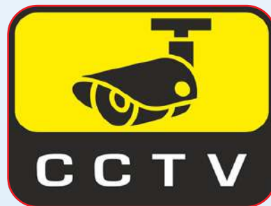
CCTV Cameras in All Classrooms