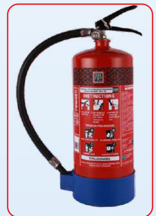
Fire extinguisher System